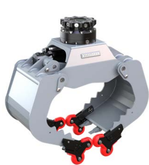
optional 4-Grip gripping device, here mounted to a A09H