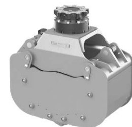
optional bolt-on side walls